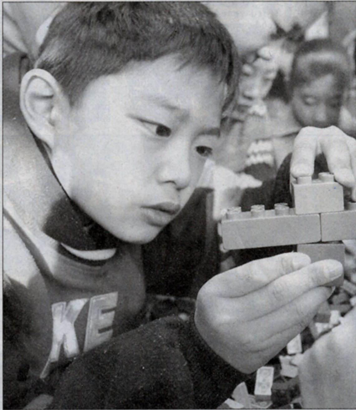
Toy joy: A boy is enthralled as he fixes a brick toy at the Green Children's library, which opened in central Beijing two weeks ago.